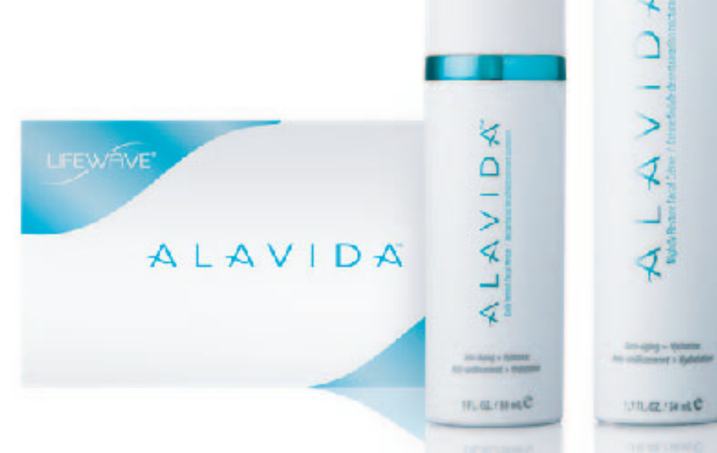
ALAVIDA Regenerating Trio

Improves the health of your skin from the inside out. 98.6% naturally derived, plant-sourced ingredients. More vibrant skin from day one. Alavida elevates Epithalamin and reduces the appearance of fine lines and wrinkles, brightens complexion for a regenerated, youthful glow, and evens out skin tone and discoloration.