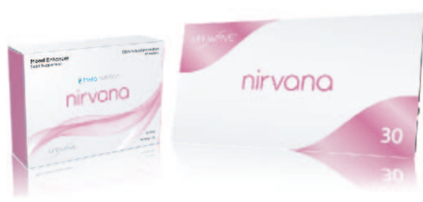
Nirvana Mood Enhancer System

Elevates healthy production of beta-endorphin to enhance mood without drugs, chemicals, or stimulants. It contributes a positive impact towards a well balanced emotional and mental health.